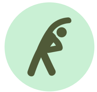
Stretch & Exercise